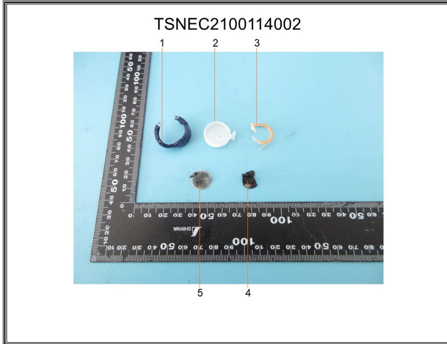
SGS authenticate the photo on original report only *** End of Report ***